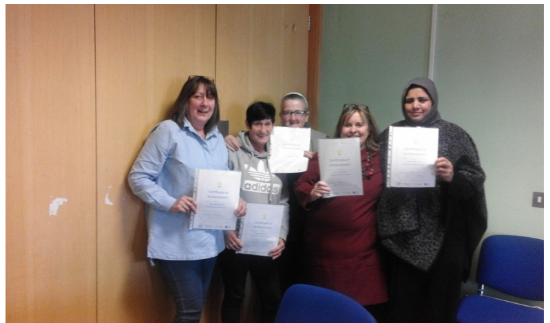
Financial Know How certificate presentation