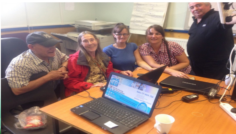
One of our working clubs...